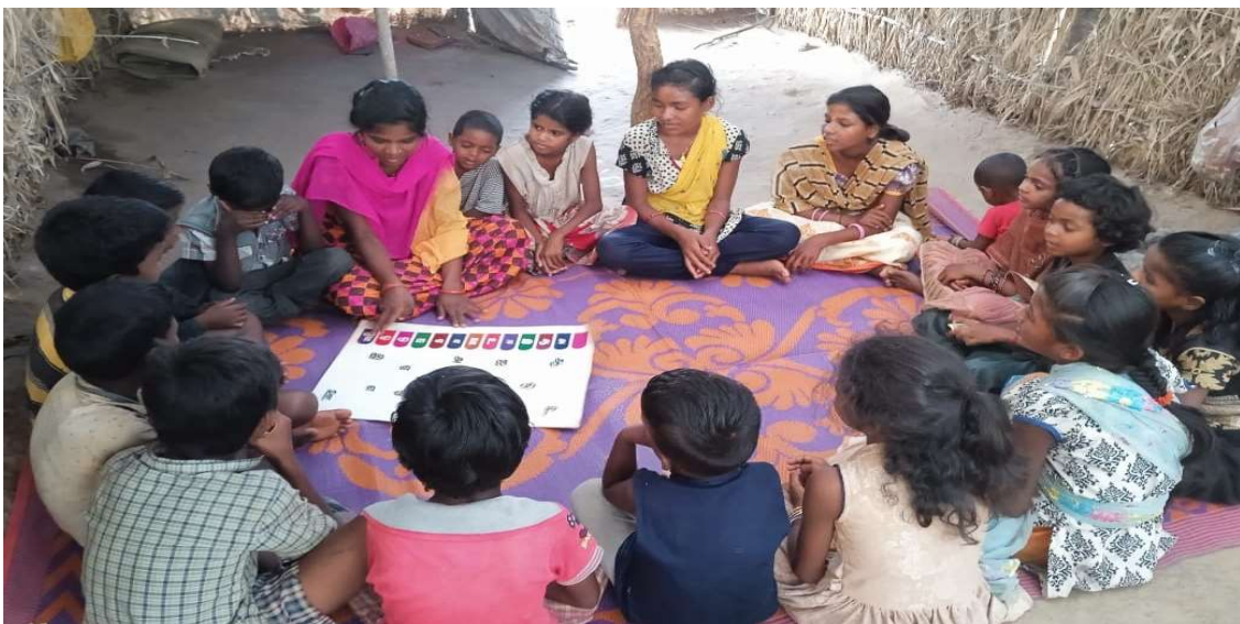
Childrens eagerly taking part in the tuition classes (payil agam)