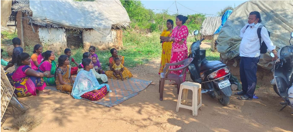
Founder interacting with the village peoples about the necessity of childrens education