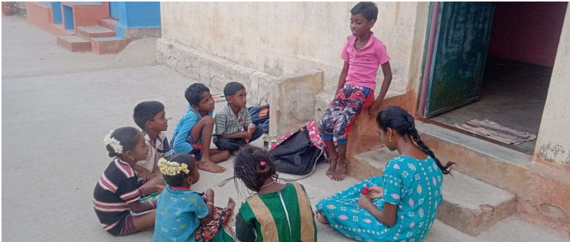
Daily class taken by the Tutors for the tribal childrens

In order to provide sufficient support to enhance the quality of education for tribal children, it is much better to select Krishnagiri District's tribal villages as they located in critical places where transport is not adequate as well as the family income. Hence it is decided to focus on the tuition centres to provide support in the tribe children education initially. Krishnagiri district has about 250 tribal villages and 10 villages were selected for this initial process where there are tribes are literally very poor.